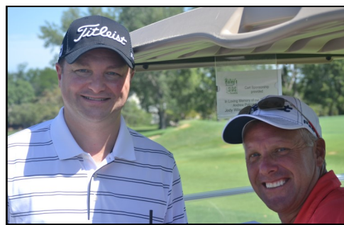
2013 SIDS Scramble