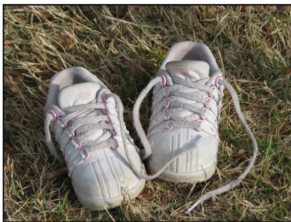
Step Up for KIDS 2014