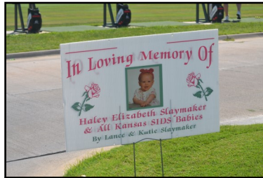
2013 SIDS Scramble