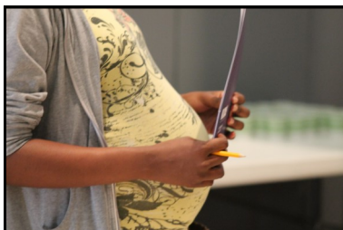
Community Baby Shower for Safe Sleep