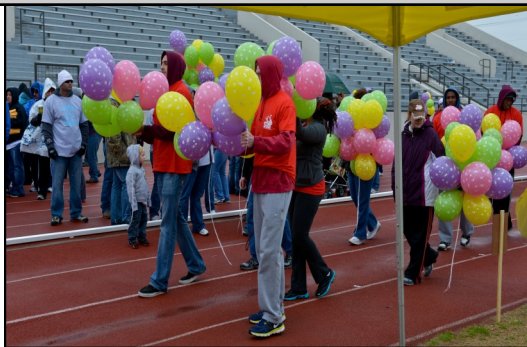
2013 Step Up for KIDS Balloon Release