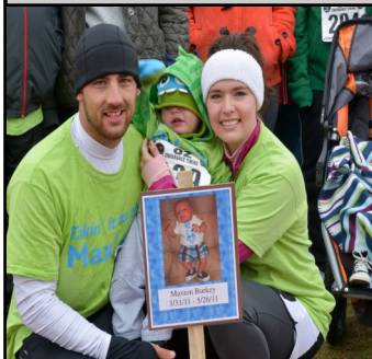
Burkey Family 2013 Step Up for KIDS