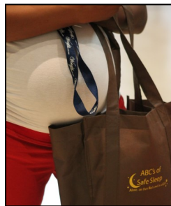
Community Baby Shower for Safe Sleep