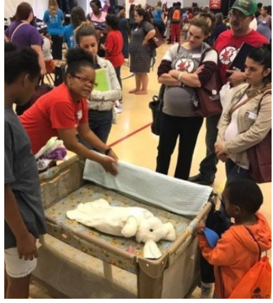
Safe Sleep Community Baby Shower